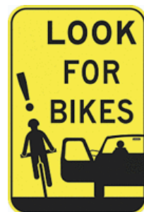
Look for Bikes