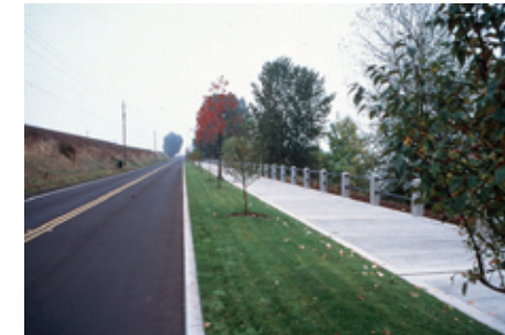
No separation between cyclist and pedestrian

Physically separated path that is shared between cyclists and pedestrians. Separation between cyclists and pedestrians may be delineated with pavement markings, surface texture, and/or signage.