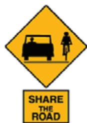
Share the Road

Normal traffic lanes of standard width where cyclists share the roadway with other vehicles and are indicated with signs such as: "Bike Route", "Share the Road" and/or "Watch for Cyclists".