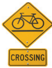
Cyclist Crossing Ahead