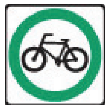
Watch for Cyclists