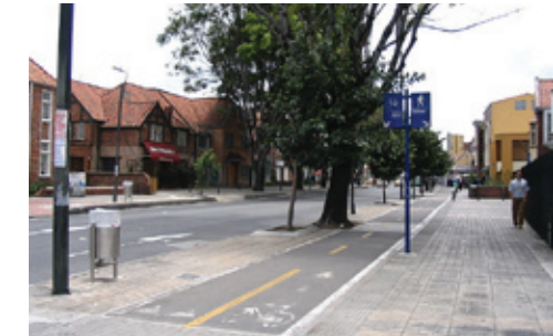
Separation with pavement markings, surface texture and signage.